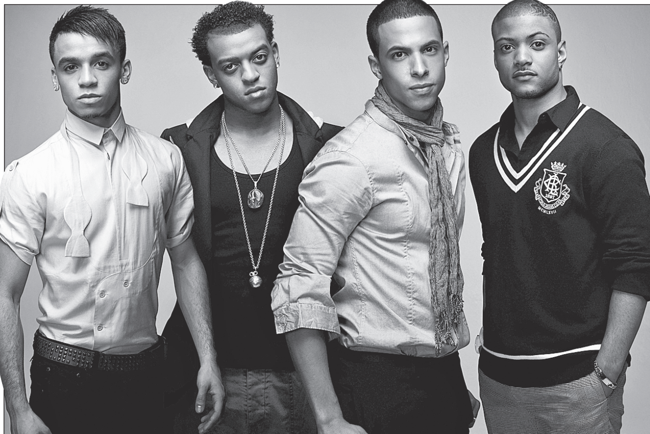
■ JLS were thrilled to meet Dame Judi Dench and discover she's a fan of theirs.

The band has a whole bunch of celebrity fans such as Pet Shop Boys and Tinchy Stryder but they were stunned to discover none