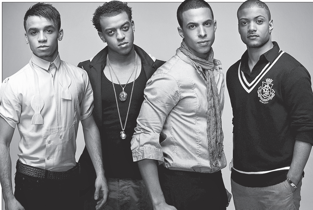
■ JLS were thrilled to meet Dame Judi Dench and discover she's a fan of theirs.

The band has a whole bunch of celebrity fans such as Pet Shop Boys and Tinchy Stryder but they were stunned to discover none