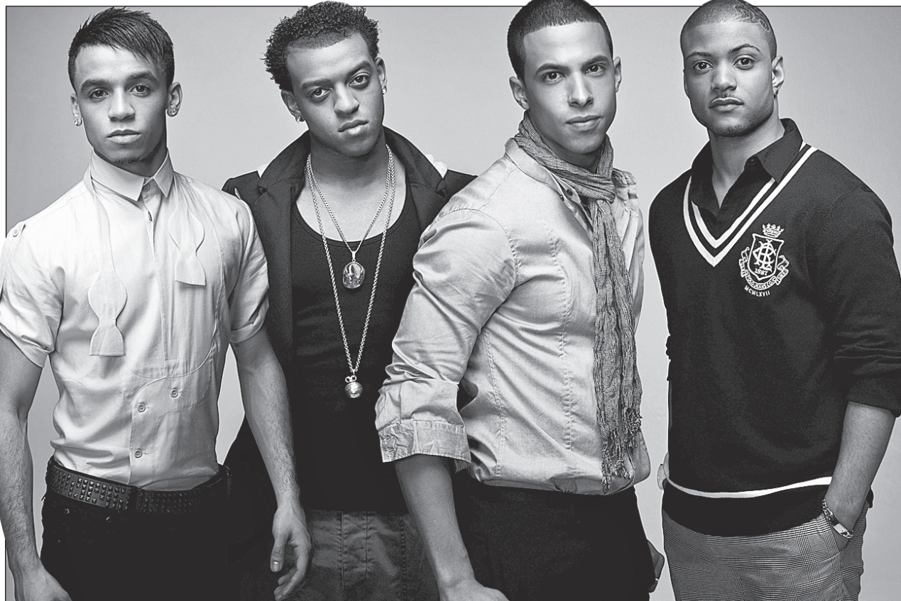
■ JLS were thrilled to meet Dame Judi Dench and discover she's a fan of theirs.

The band has a whole bunch of celebrity fans such as Pet Shop Boys and Tinchy Stryder but they were stunned to discover none